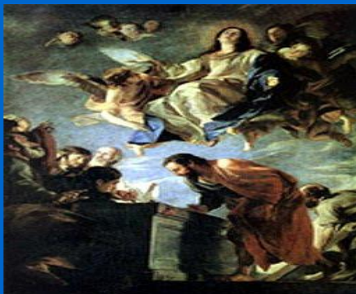
This Photo by Unknown Author is licensed